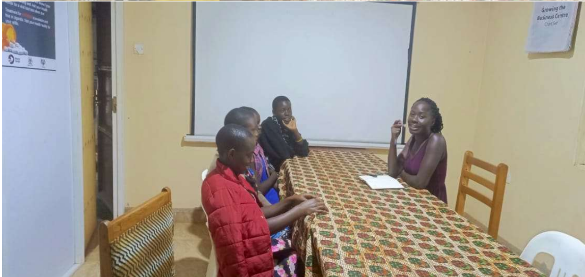
Games and recreation session to energize and refresh