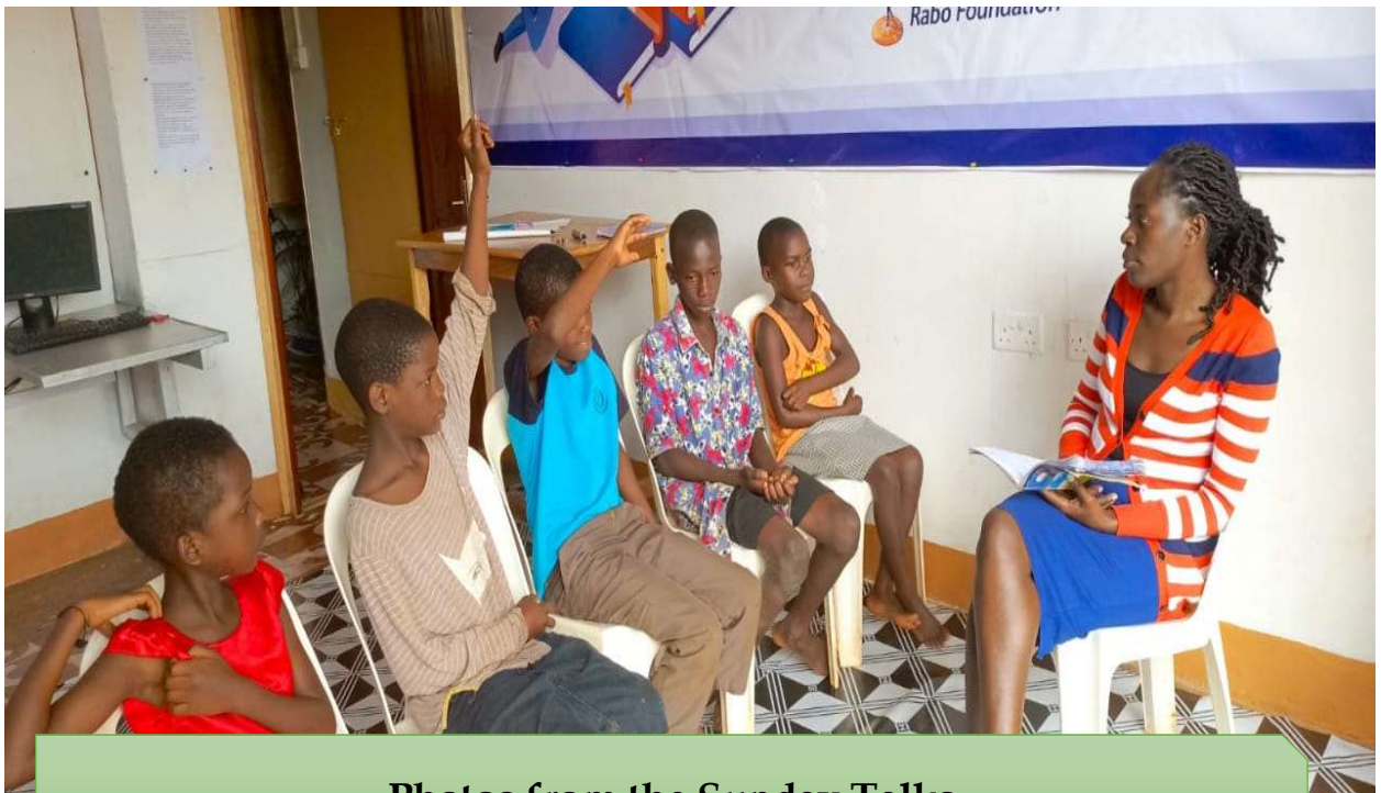
Photos from the Sunday Talks