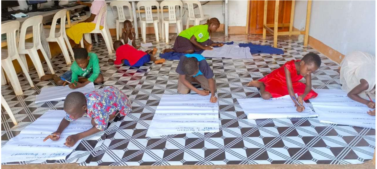
Puzzles classes and group discussion for the upper classes.