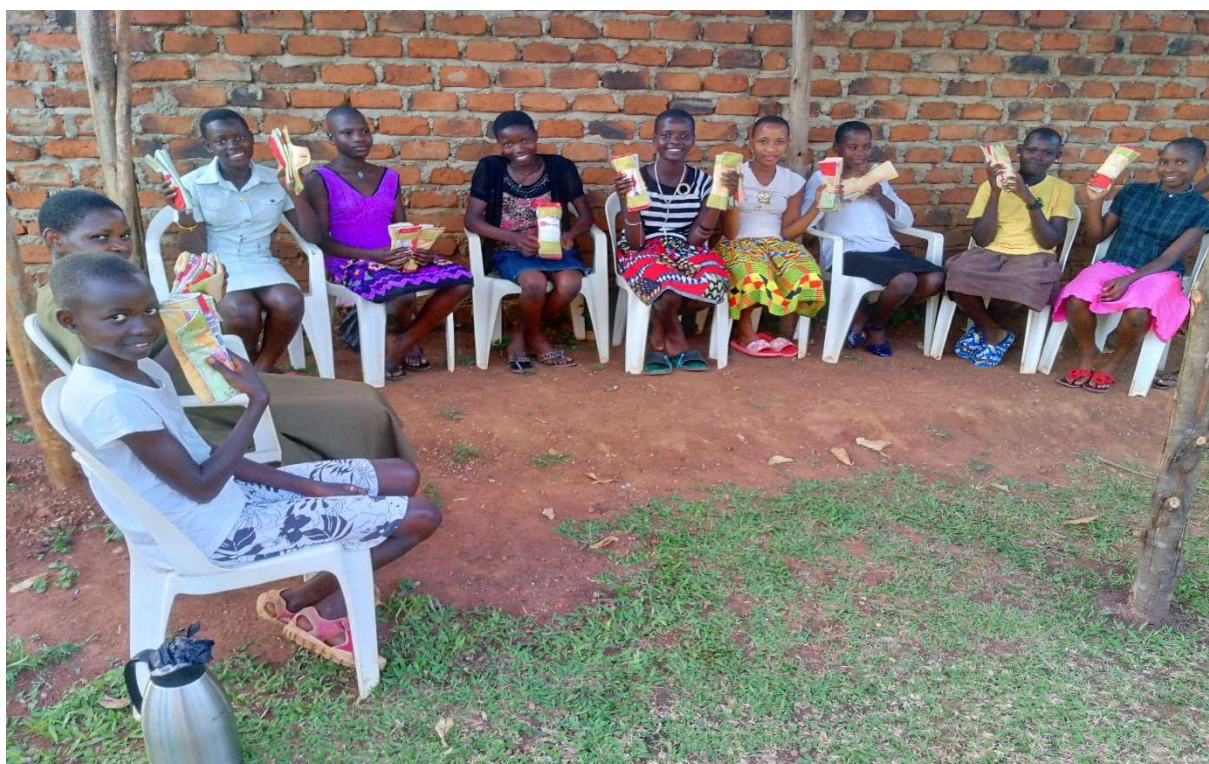
Coach Fedia explain the a reusable sanitary pad is used to the younger girls.