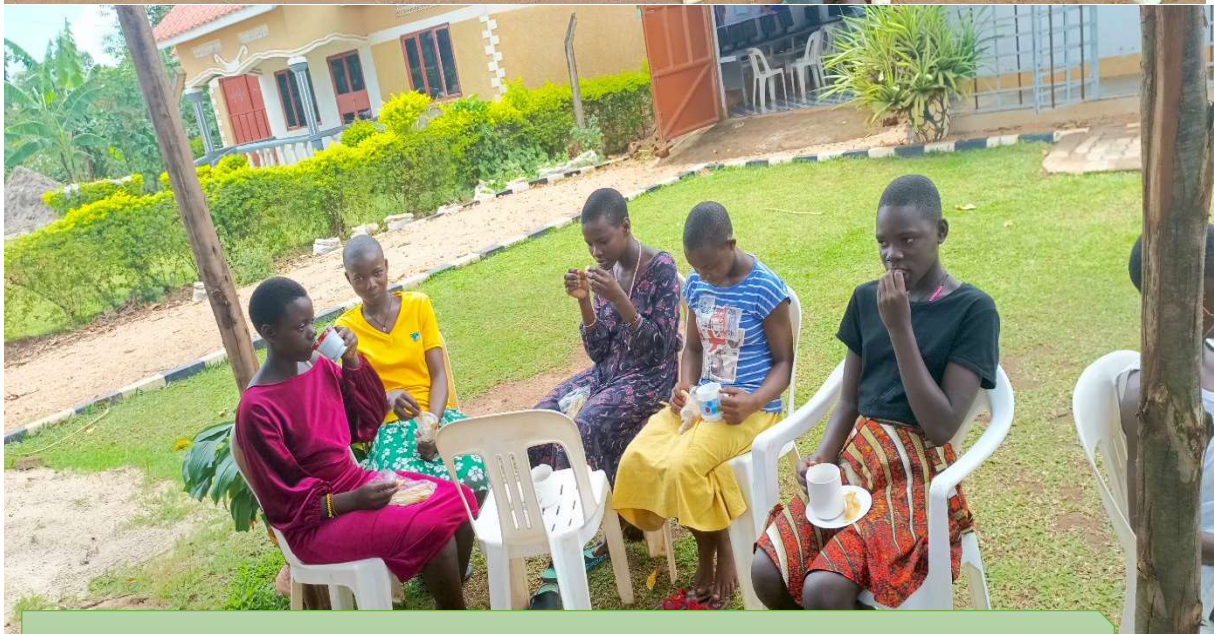
Revision work for the lower class