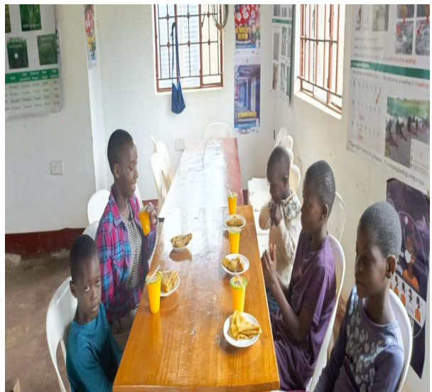
Break time students having break tea.