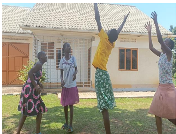
Games and recreation session to energize and refresh.

Dear all that is for our first week and you will be kept posted even for the second week.