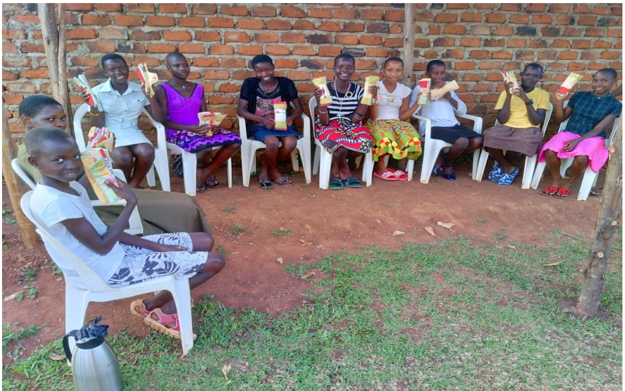
Girls receiving Reusable sanitary pads after the explanations on the usage.