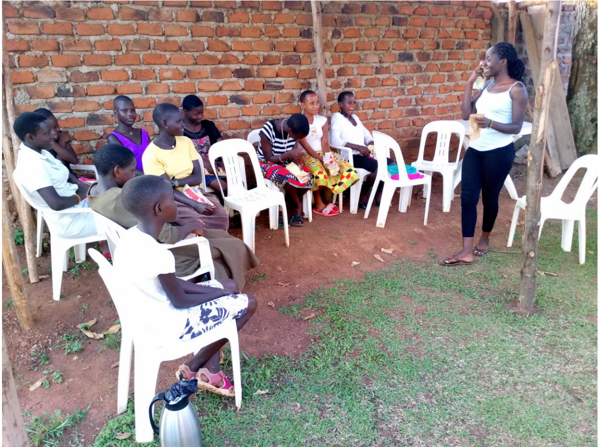
Coach Fedia explain the a reusable sanitary pad is used to the younger girls.