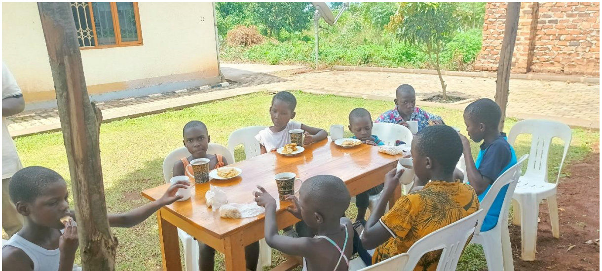
Break time students having break tea.