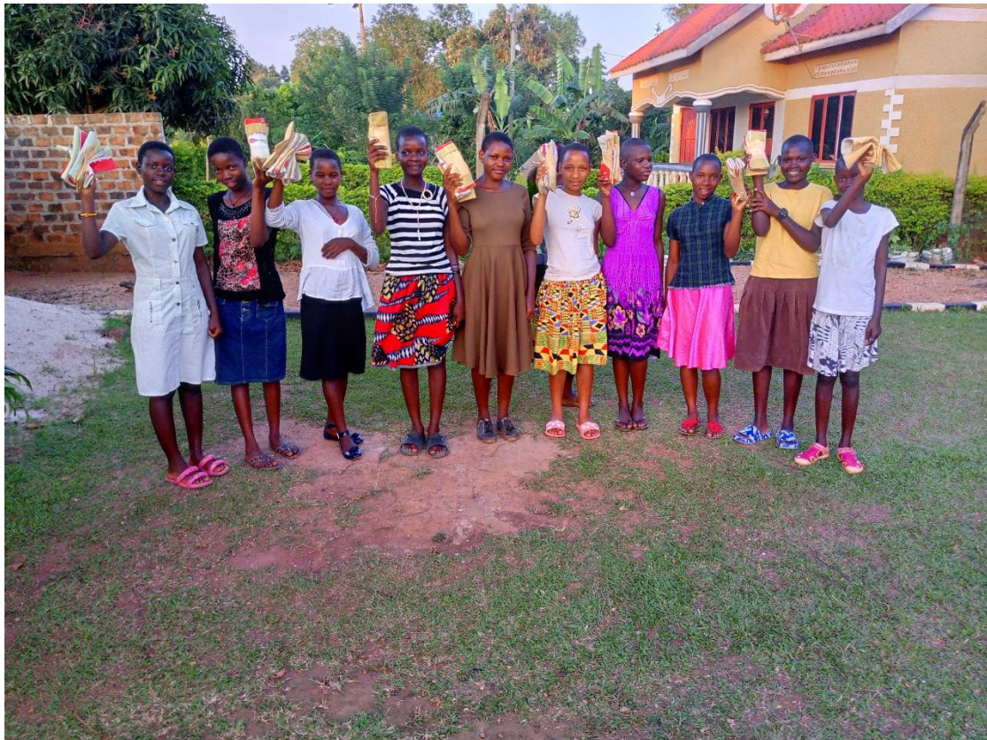
Girls happy after receiving the packages