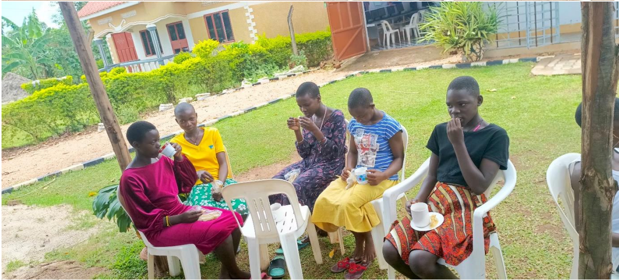
Break tea for the upper classes.