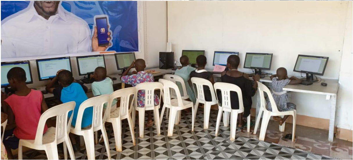
Students learning computer application skills.