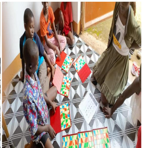
Puzzles classes and group discussion for the upper classes.