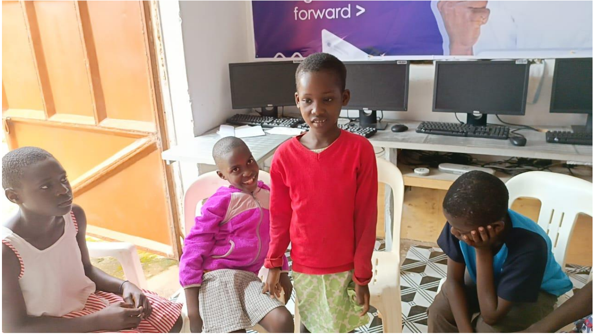
Grace sharing her story during story sharing session.